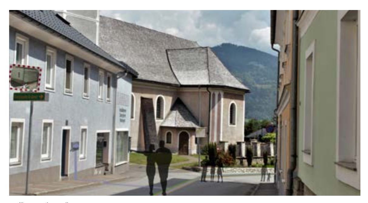
mailbox on the wall