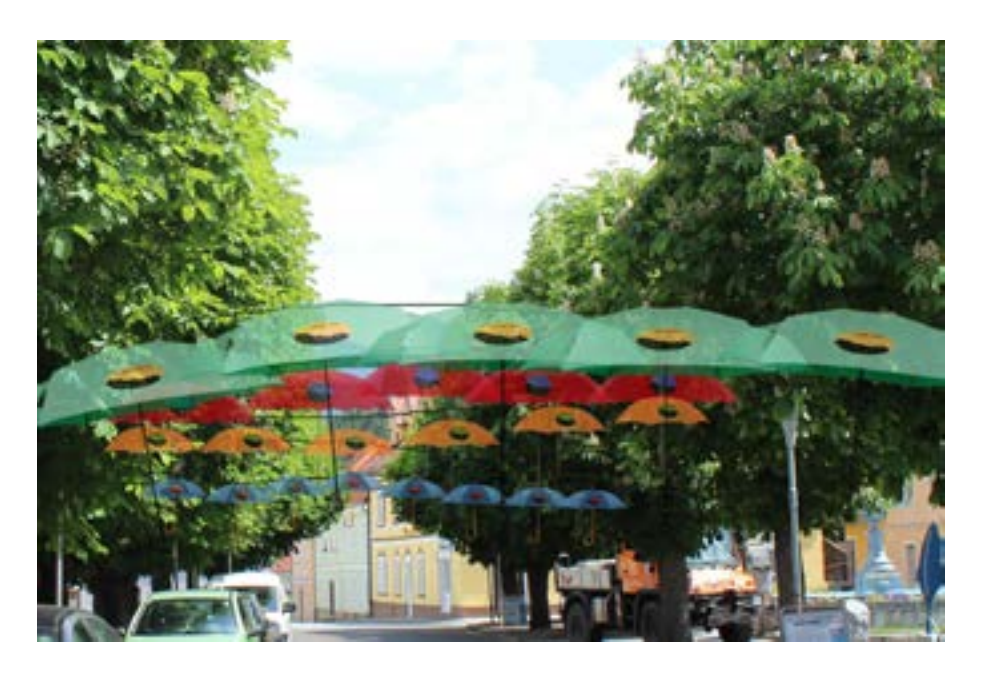
main square/ perspective