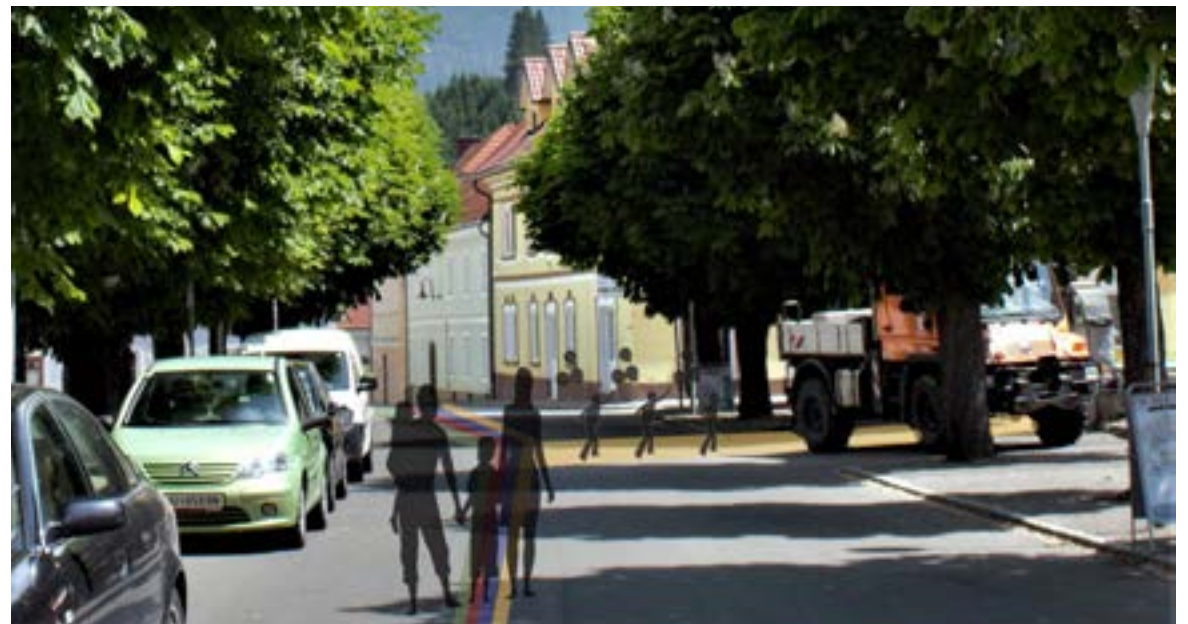
main square / four different lines on the street