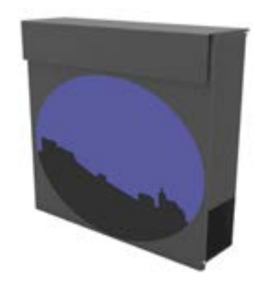
mailbox with the logo