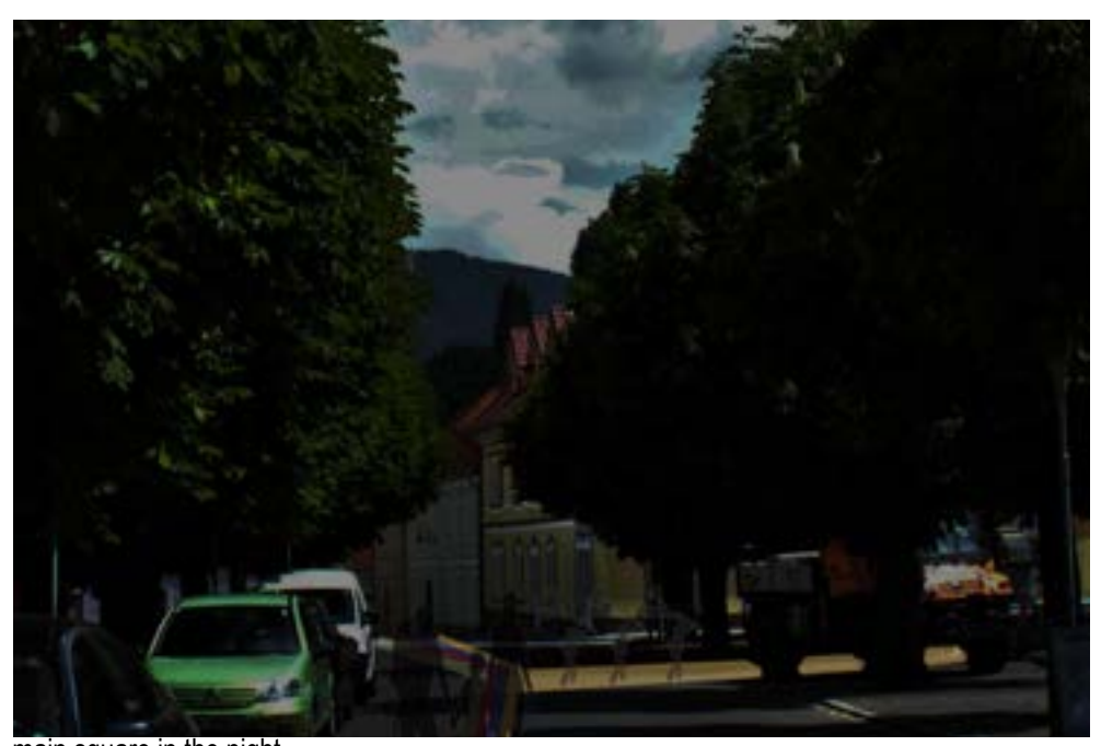
main square in the night