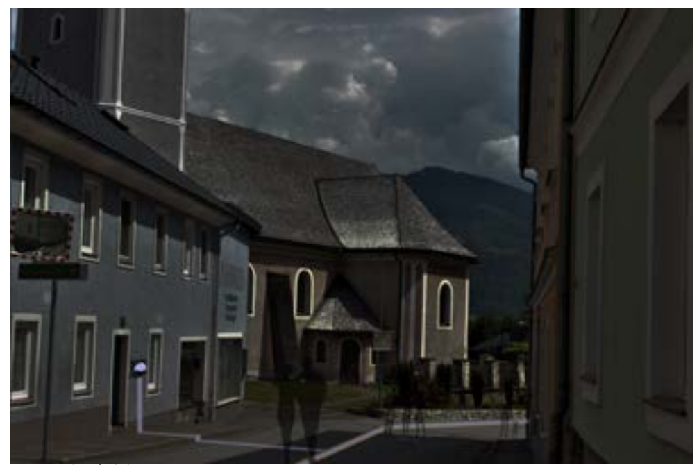
perspective / night