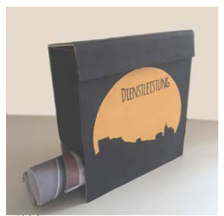
model pic 1